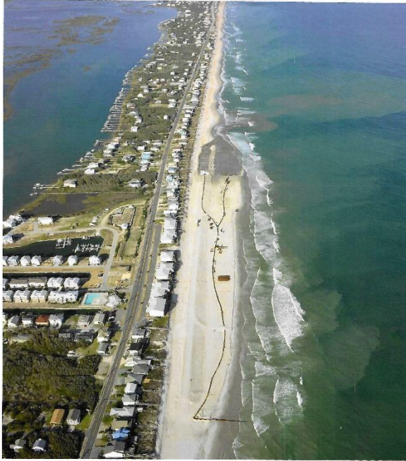
Topsail Beach Nourishment and Channel Dredaina Project Image # 77 Date 03.18.2020

shows, the nourished stretch of beach includes a new dune, 25-foot wide at the top, and an extended beach area beyond its toe. This creates a much wider beach providing more protection for the Town from the impacts of future storms, as well as greater recreational beach area. Significant progress has been made since these photos have been taken.