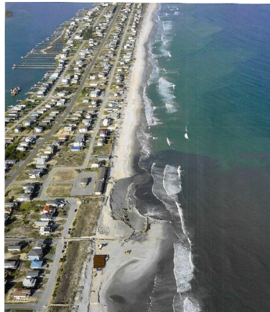
Topsail Beach Nourishment and Channel Dredaina Project Image # 74 Date 03.18.2020

Even though our beaches are still open, areas where the sand placement is taking place is still a work zone. For your safety and the safety of the workers, please avoid the designated work areas. DO NOT CROSS THE FENCES AND BARRICADES INTO THE WORK AREAS.